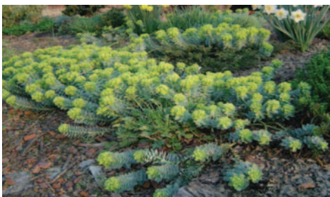
Euphorbia myrsinites —Myrtle spurge

advocate mountains of compost and organic mulch for Mediterranean herbs and perennials. To the contrary, my memories of vibrant wild colonies of rosemary, sage, thyme and lavender in what's called the Mediterranean "garrigue"—essentially treeless zones dominated by many of our favorite fuzzy plants--didn't include any organic mulches. And I doubt there were