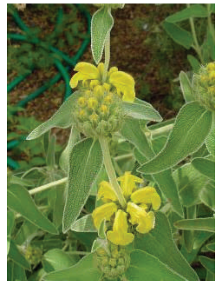
Phlomis fruticosa —Jerusalem sage