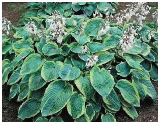
Hosta 'Frances Williams'