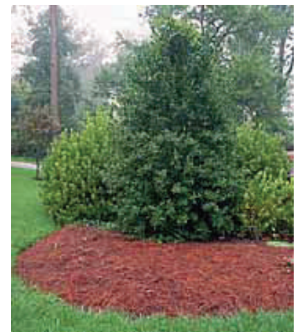
Ilex ‘Nellie Stevens’—Holly