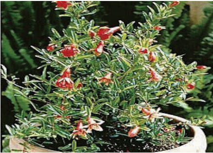
Punica granatum var. nana —Dwarf pomegranate

My Med Bed adventure is still ongoing, so I don't have all the answers and I bet there are many gardeners with experience with Mediterranean plants that I can learn from. I hope to see those and other gardeners at the Sept. 16th meeting when I'll share slides and stories of growing Mediterranean gardens in the piedmont, which is definitely "Not Under the Tuscan Sun."