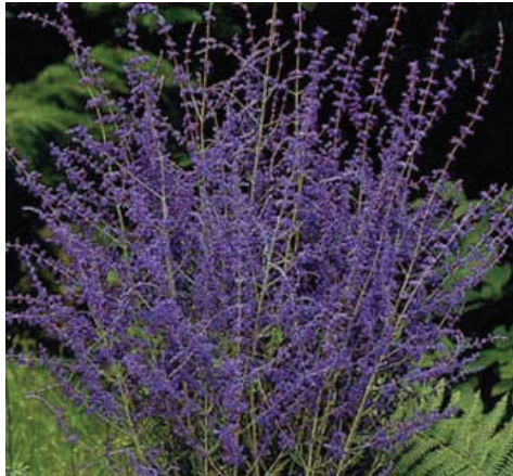
Perovskia atriplicifolia 'Blue Spire'—Russian Sage

I suspect the hopeful keepers of these gray and fuzzy exotics were following the advice of so many garden books which