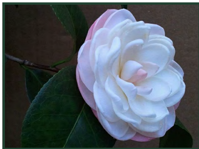
Camellia japonica 'October Affair'