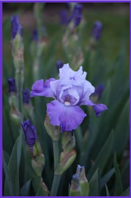
Silgrey's Beauty—tall bearded iris

neighbors brought bearded irises into the lives of a new generation, decade on decade, sharing their passion for the rainbow with every twinkly eyed neophyte that strolled past on a mid-May afternoon. In that way bearded irises are beatnik passalongs, entering gardens more often through the back gate in a paper grocery bag than through the front in a black plastic pot.