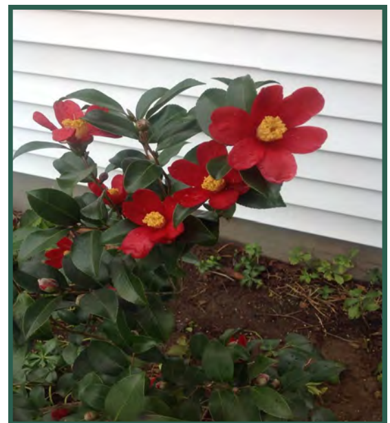
Camellia japonica 'Mieko Tanaka'