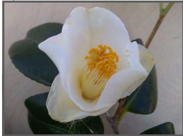
Camellia japonica 'Korean Snow'

ferences were over a spectrum with graded changes from plant to plant. By seeing a population it was obvious these were a single variable species not two separate species. At this site we were invited into the home of the vil-