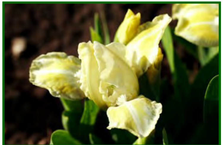
Baby Venus—dwarf iris

The diversity of bearded irises rivals that of any herbaceous perennial we can grow in temperate climates, sporting nearly all colors of the rainbow and innumerable permutations and variations. With such a banquet of cultivars and types to relish and feast, we're going to have a merry time. Amplify that with my tending-towards-hyperbolic nature of talking about plants, and this conversation is going to get thick in no time. I have so many cultivars to share, but limited pages in which to share them! I've employed the help of my fellow