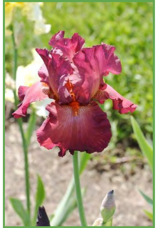
Lady Friend—tall bearded iris

Sitting in front of my bookshelves looking at my nearly complete collection of the Bulletin of The American Iris Society from 1920 through the present, I'm daunted by the legions of passionate iris soldiers that have gone before me—breeding, writing, lecturing, judging, and exhibiting our favorite flower for decades before my existence. Though a little overwhelmed at the magnitude and depth of inquiry possessed in these tomes, I've found relief in one unifying idea—the body of their works exists because of an undying love for the genus Iris . I've taken it as a rally cry to translate that love into