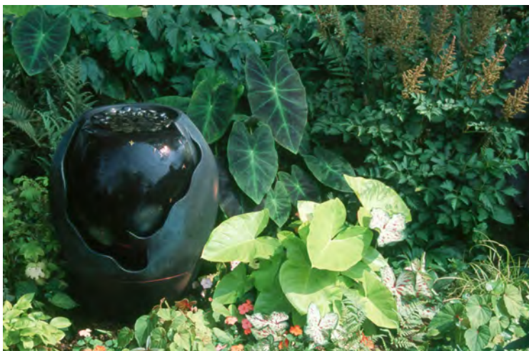
A perfectly sited small water feature adds so much to the overall landscape design.

You may want a water feature. A simple recycling fountain can add the perfect amount of white noise needed to drown out the drone of neighborhood sounds, with constant trickling or splashing. A bowl of goldfish residing in a shady nook, a tub filled with hardy water lilies, or a narrow stream bubbling along a garden path are miniature water projects that will embellish your small landscape.