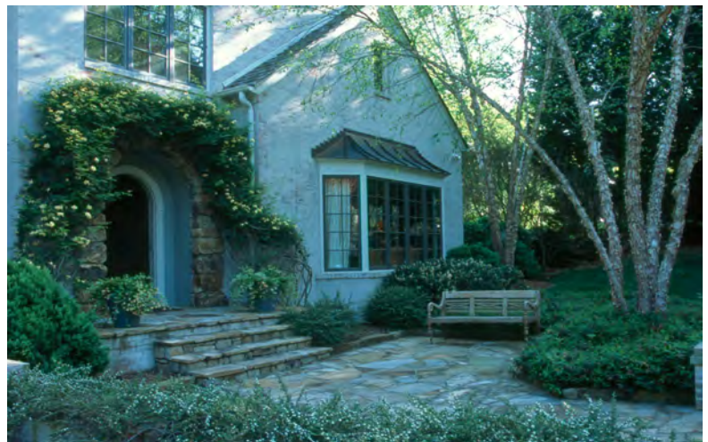
Harmonious color unifies this Raleigh landscape.