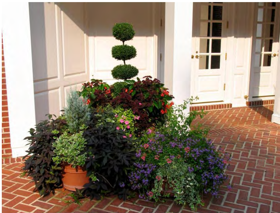
A group of pots creates a focal point

Containers, when it's hot and dry, should be checked everyday. If they need water, do so until you see water coming out of the bottom of the container. The frequent watering required to keep your container plants healthy also flushes out any nutrients you have in the soil, adding a good slow release fertilizer is a good idea. You could fertilize more frequently with a diluted water-soluble product. Any slow release pellets you have used should be changed out with each seasons new plantings.