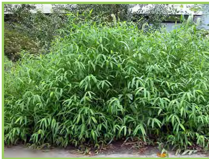
Microstegium vimineum (Japanese stilt-grass)

The name "weed" is from Old English weod and Anglo-Saxon wiod , a general all-purpose word for herbs, grass, or weeds. "Weed" is not a botanical or horticultural designation. Which plants are weeds depends on one's viewpoint. Ralph Waldo Emerson said in 1878 that a weed is "a plant whose virtues have not been discovered." Thus, a weed is a plant growing where it is not desired or is unwanted and generally objectionable.