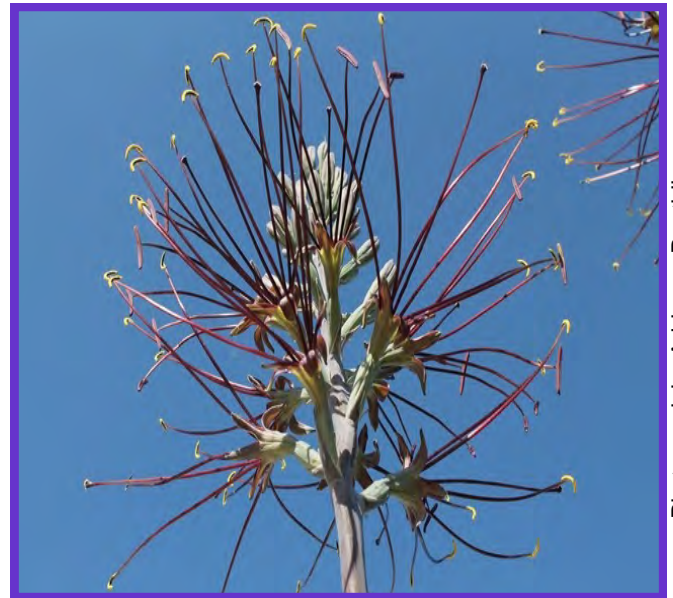
Manfreda undulata ‘Chocolate Chip.’