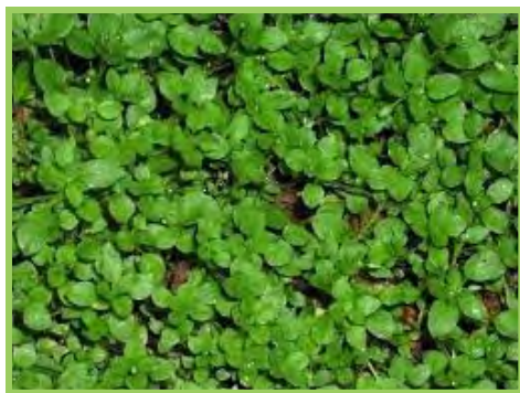
Stellaria media (chickweed)

September is the anniversary of Hurricane Fran's visit to the Triangle in 1996. Fran taught me a thing or two about weeds when it brought down thirteen large deciduous trees in the garden. The shade that disappeared with the trees provided just the environment for unwanted plants whose seeds lay dormant in the shade, perhaps for years. The first season after Fran, the comely pokeweed ( Phytolacca americana ) popped up by the hundreds, producing messy berries that were enjoyed by, but further spread by birds. After controlling pokeweed, two years later the soil produced an invasion of poison ivy ( Rhus radicans ).