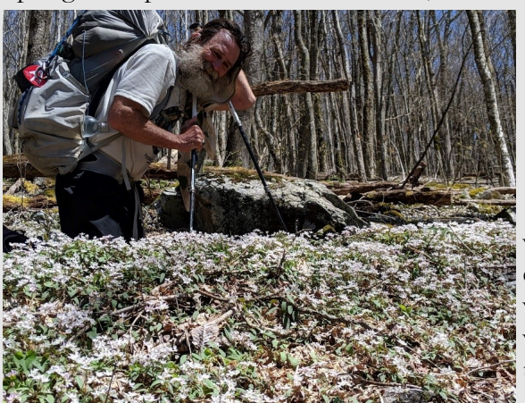
Dad stopped to admire the carpet of Claytonia virginica we walked through for over a week in Tennessee during the beginning of spring.

While we kept our eyes open for signs of color on the forest floor, we kept ourselves entertained by taking note of the dormant shrubs and trees around us, learning to appreciate the buds that would soon give way to flowers and foliage. Except for the odd houstonia or cardamine, it took twenty days and a hundred and sixty miles to see our first significant wildflowers, patches of toad trillium at Lake Fontana just before entering the Smoky Mountains. And after that trillium patch, save for the odd claytonia popping out at high elevation in the Smokies, another two weeks would pass before what we could comfortably call spring was upon us. But when it came, it came