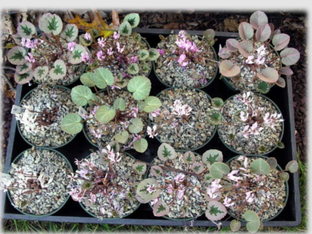
Cyclamen mirabile Tilebarn Anne and Tilebarn Nicholas

flowers are unique in that the cone of stamens protrudes well below the mouth, somewhat resembling a