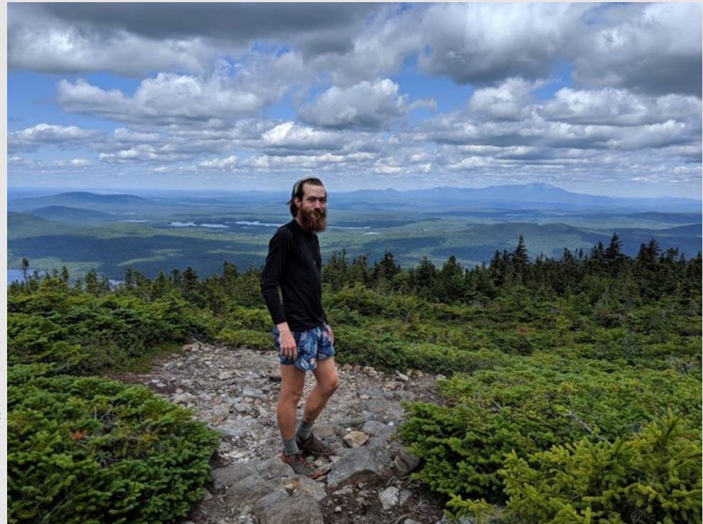
One of the reasons why the views were so hard to beat in Maine. This was the first glimpse of Katahdin, just under halfway through the 100 Miles Wilderness.