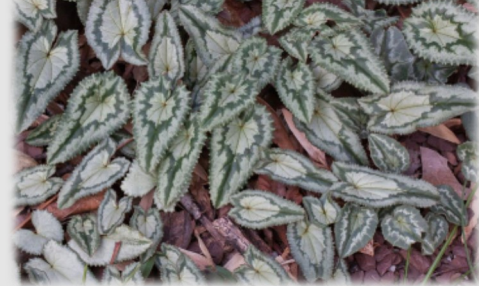
as late July, especially after a Cyclamen hederifolium rainstorm, but the main display is in October, before the leaves emerge.

Cyclamen hederifolium is distributed in southern Europe from southeastern France and Italy through mainland Greece, on the Greek islands down to Crete, and eastward to southwestern Turkey. It is also known from Bulgaria and the former Yugoslavia. Thus, it is not surprising that it is quite variable. Plants with pink and white flowers are found throughout its range; whites are much rarer in the wild than in cultivation. Dark purple and red flowers have recently been added to the palette. The leaf shape varies tremendously, from the usual ivy shape suggested by the specific epi-