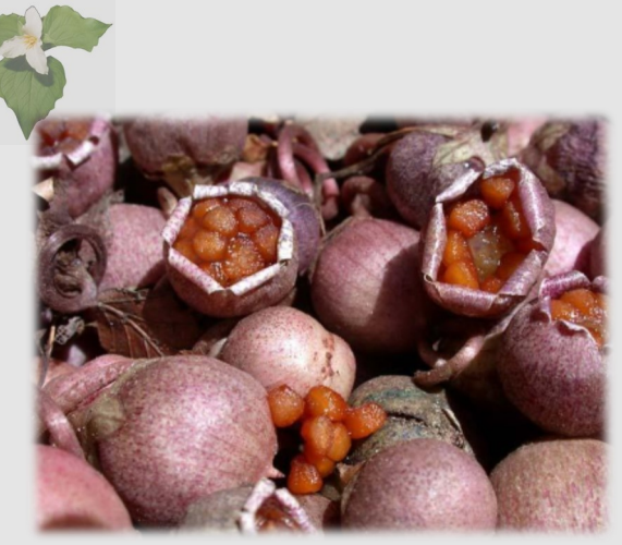
Cyclamen hederifolium seeds and seed pods

can be a problem during fall through late winter; in the eastern USA this phenomenon is very rarely an issue. Spent flowers and flower stems can act as nuclei, so it is best to remove them as soon as possible.