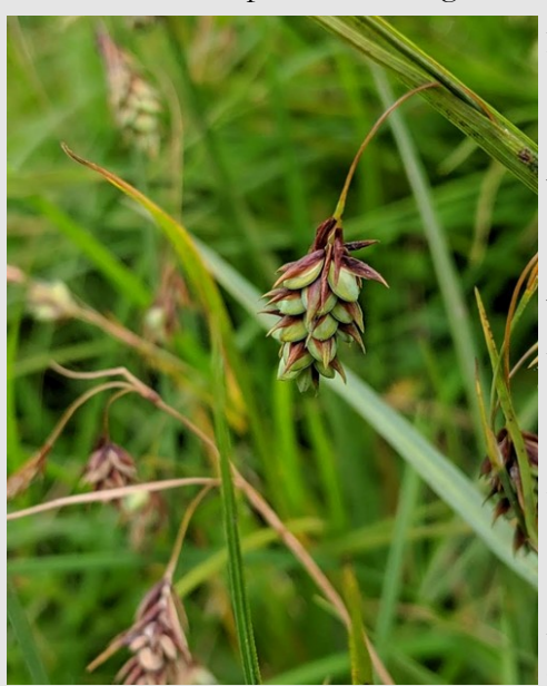
Carex magellanica, one of the many species of sedge that were present in the bogs of the northeastern section of the trail.

came across our first bogs, filled with sundews and pitcher plants on sphagnum laden shores. Beaver ponds that were ringed with spiraea, viburnum, and Ericaceous species held large mats of floating spatterdock and water