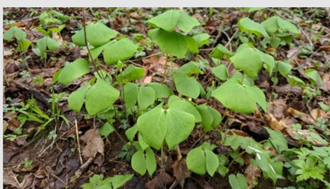
One of the most exciting discoveries of the trail, this was one of two patches of Twinleaf (Jeffersonia diphylla) that we came across in Virginia.

most miraculous landscape views in North America. From the Smokies, we quickly crossed over Max Patch, the Roan Highlands, Grayson Highlands, and into the Washington and Jefferson National Forests. By the time we got to the James River in early May, we had seen everything from skunk cabbages to Catawba rhododendrons flowering on the trail. The first seven hundred miles had delivered more to us in terms of plant diver-