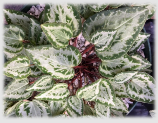
Cyclamen graecum ssp. candicum