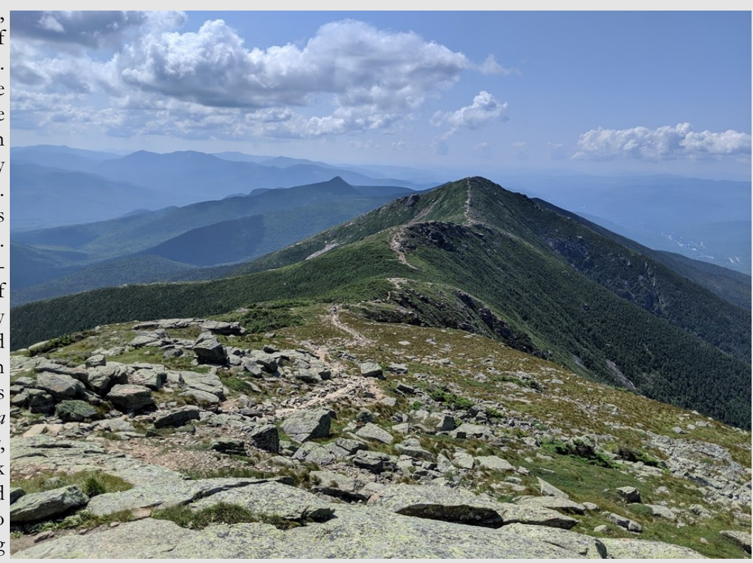
rockcresses, moonseeds, The imposing view back over Franconia Ridge, home to Geum peckii and Potentilla robbinsiana. This was, meadow-rues, indian hemp, without a doubt, one of the most scenic days of our thru-hike.

through. But it was summer, and there were still plenty of flowers to be appreciated. There were many days where most of the new plants we encountered were Eurasian field weeds, but to us, they were enjoyable all the same. And of course, native plants still abounded all around us. Over the rocks of Pennsylvania, through the wetlands of New Jersey, and in the rocky woodlands of New York and Connecticut, we were seldom out of eyesight of the blooms of the mountain laurel, Kalmia latifolia as well as K. angustifolia, a new species to us. The pink and white clouds surrounded us as we were introduced to new wildflowers including rockcresses,