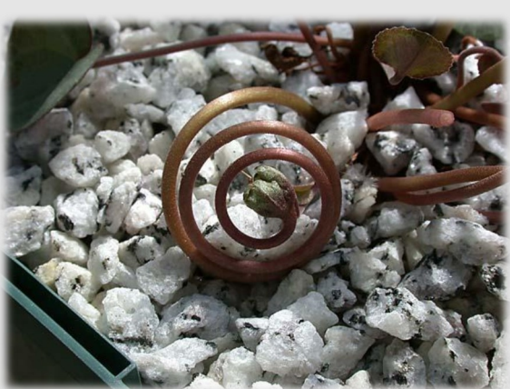
Cyclamen purpurascens setting seeds

Seed should be sown as fresh as possible, typically by late August. The same compost used for mature plants is used for seed, which is surface sown and covered with a ½-inch layer of grit. After watering, the pots are stood in a shady place and kept evenly moist. By late October, here, the seeds start to germinate, and the fun begins. It is beneficial to keep the seedlings, which consist of a single cotyledon leaf, growing as long as possible, keeping them cool, shaded, and well-watered. When they finally go dormant, they should be given more moisture than mature specimens, because they can be very prone to desiccation. Seedlings are potted up singly towards the end of their first summer dormancy, ideally as the plants are "thinking" about waking up. After potting, they should not be allowed to dry out at all. Some species (e.g., C. hederifolium) can flower in their second year, but most require two to four years; C. rohlfsianum generally takes the longest, up to five years from seed sowing.