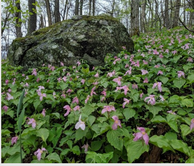
One of the most illuminating days of the entire hike happened in the Jefferson National Forest as we criss-crossed the Blue Ridge Parkway between giant colonies of Trillium grandiflorum.

sity than I was hoping to find on the entire trail, and with the remaining two thirds farther