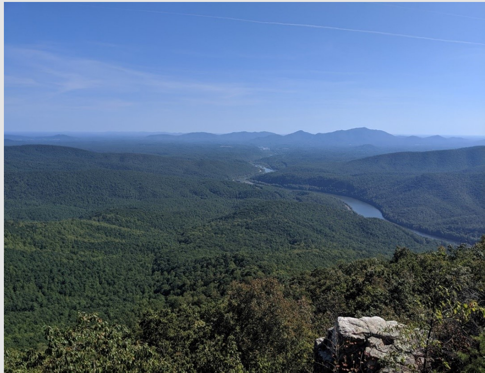
There could not have been a more perfect sendoff than being greeted by the James River under clear blue skies to end our botanical foray into the Appalachian Mountains.

The opportunity to botanize the entire range of what I call my home mountains, beginning before the first buds of spring opened and finishing as the fruits of autumn were falling to the ground, was something I never knew that I needed to do. To become intimately familiar with the Appalachian flora through firsthand observations over the course of a whole growing season and across almost the entire range of the mountains was simply an indescribable experience. The plants that we saw were only a small part of the trip as a whole, but they played such a central role in the journey, stitching together our experiences as we walked each day from one campsite to the next.