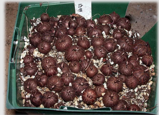
Cyclamen graecum seedlings

It is possible to grow superb specimens of all species in containers. Although subtle variations in cultivation can benefit certain species, the reality is that most can be treated in exactly the same way. Seed-raised