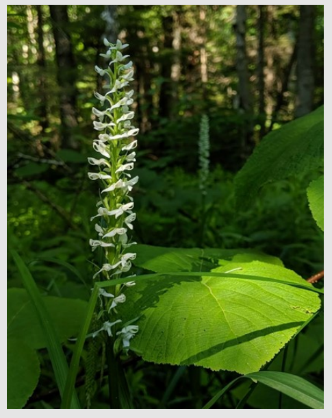
didn't key out in our Weakley's Flora. From this point on, we knew we weren't Kansas anymore

lilies. The forests, especially when we began to regain elevation as we headed into Vermont, became much more coniferous in nature. Shrubs and wildflowers suddenly were appearing around us that I was unable to key out in my out in my Weakley's Flora, which had faithfully served us for as long as we were within its jurisdiction of the southern and mid- atlantic states. Orchids, which had been sparse on the journey thus far, were becoming more and more common to see. Ericaceous herbs beyond pipsissewa, including moneses and pyro- Platanthera dilatata was the first plant that la were dotting the forest floor. Summiting moosilauke, the first of New