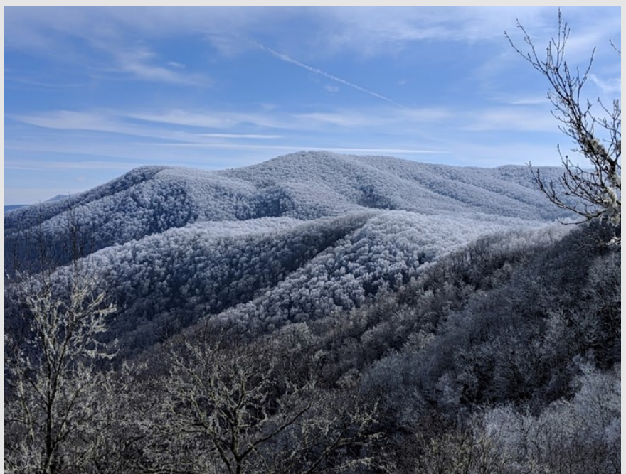
The beginning of our hike saw much more ice than wildflowers. Here is a view near Wayah Bald, NC, taken on March 5^{th} , the morning after a fifteen degree cold front froze most of the rain from the day before.

with a fury. As we passed through Davenport Gap at the northern end of the Great Smoky Mountains National Park, we were greeted with trout lilies, toothworts, miterworts, cohosh, bloodroot, bellworts, and everything that we had been scanning the ground for over the first two hundred miles. From this point on, it didn't really slow down!