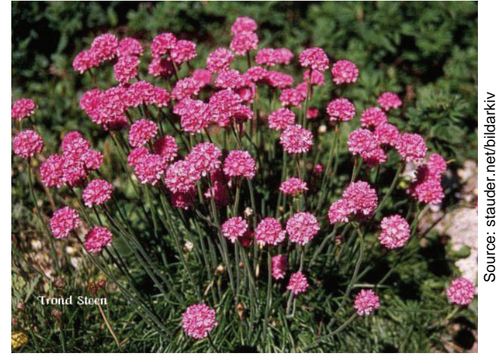
Armeria maritima 'Splendens'

What's on my plant wish list? First, I'm thinking of some easier ones, yet plants that I wouldn't want to be without. And these are versatile enough so that they could be planted in the front of the garden, on walls, in the rock garden or in containers. I'd plant the early flowering