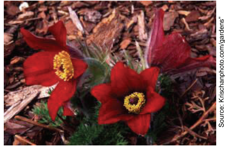
Pulsatilla vulgaris 'Rote Glocke'

One idea I'm entertaining for this spring is turning over a small spot on one end of a perennial border into a 15' x