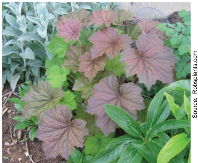
Heuchera villosa 'Autumn Bride'

And it's not all about flowers. There are perennials that can stand alone for their distinctive foliage. Armeria, Dianthus, Iberis, Sedums and Sempervivums are well regarded for sunny conditions. And in the sun, or shade, the popular Heuchera 'Palace Purple Select' can't be ignored. The lesser-