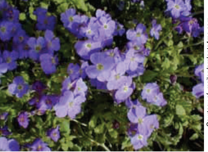
Aubrieta 'Cascade Blue'

15' feature for some of these small plants. I'm going to search for some limestone rocks (indigenous to the Ken-