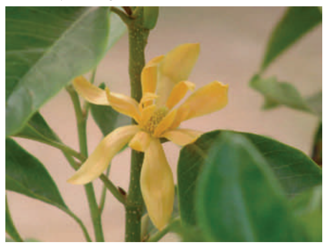
Magnolia champaca flower and seed pod

This new taxonomy in itself doesn't change anything for the average gardener. But what it did do was renew interest in this group of plants by magnolia collectors and hybridizers. This renewed interest has resulted in a lot of work on hardiness. Before the reclassification, many of these species were assumed tender because most of them are found in subtropical and tropical regions. It turns out that there is a great deal of seedling variation in hardiness. For some reason known only to Mother Nature, many of these evergreen species have genes for hardiness. The happy consequence of this is that gardeners in Zone 7 can grow many of these species if selection for cold hardiness is made. For example, I grew up a batch of seedlings of the 'joy perfume tree' [Magnolia (Michelia) champaca] listed as hardy to Zone 9 or 10 depending on the information source. Two of the seedlings survived in my garden west of Chapel Hill, NC (Zone 7a) for several years and are now 20 feet tall. Another example is Magnolia (Michelia) floribunda. Most sources of this species proved tender in Zone 7. Tony Avent of Plant Delights Nursery, Raleigh NC has an authentic hardy plant of this species. A plant grown from a cutting Tony provided is growing well in my colder garden.