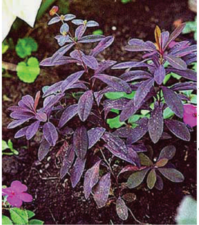
Euphorbia dulcis' Chameleon'

And Salvia argentea , the silver sage, could be combined with the purple-brown foliage of Euphorbia dulcis 'Chameleon'. And, since we're not being too fussy about