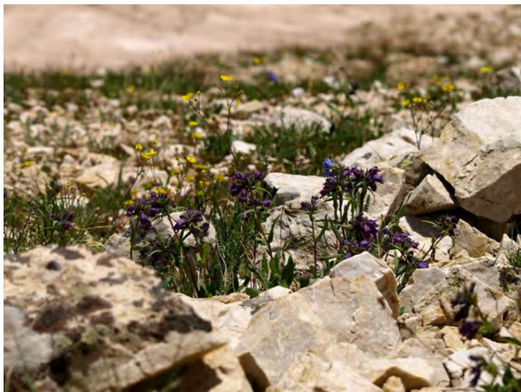
Snowbank and Penstemon whippleanus

Laboring up higher in the thin air and wandering into an area with more soil and moisture brought another change in the flora. More grasses grew with a mixture of wildflowers. Pedicularis parryi , a hemi-parasite, blossomed with spikes of pastel yellow and off white twisted mint like flowers held above rosettes of fern like foliage. A few species of Trifolium made their homes in these open meadows as well. Much more attractive than the Trifolium repens that invades planting beds and lawn in the East, the alpine species have larger individual florets of burgundy ( T. parryi ), pink ( T. nanum ), or a bicolor of cream and pink ( T. dasyphyllum ). Two species of Polygonum also popped up amount the grass as well.