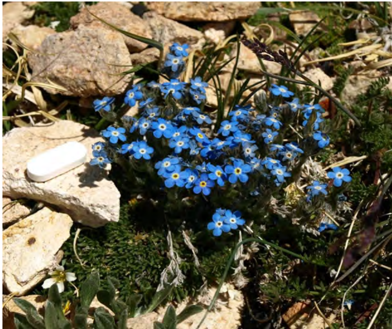
Eritrichium nanum var. elongatum

Starting the hike up the mountain, I encountered the diminutive legume, Astragalus molybdenus , with its pale lavender pea flowers and feather like creeping foliage flowing over the gravel covered ground along the path. Up on an exposed bank a clump of intense blue flowered Mertensia oblongifolia , only 6" tall, arched out from between a scattering of loose stones. A short distance away the Colorado endemic, Polemonium confertum , clothed in deep green ferny foliage holding wide open indigo blue blossoms with yellow stamens grew in an equally rocky situation. Continuing up the trail, many of the plant seen the day before also grew. Patches of Penstemon ballii , mounded tuft of white flowered Phlox condensata , and Erigeron pinnatisectus just to name a few were joined by the clumps of bottle brush looking purple inflorescences of Phacelia sericea and gold daisy inflorescences of Packera and Senecio species. On slopes protected from wind, shrubby Salix shaded the rosettes of Saxifraga rhomboidea which then thrust up their 15" stalks topped in clusters of creamy white 5 petaled flowers. In some exposed areas the 2" tall Salix reticulata var. nana carpeted ground and crevices between stones with their tuft like clusters of heavily veined rounded leaves and upright catkins. On another bank, Valeriana acutiloba formed clumps of glabrous, entire-edged leaves top by with expanding inflorescences of the palest pink buds opening to