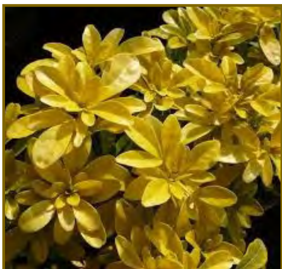
Choisya ternata 'Sundance'

Broadleaf evergreens play an important role in enhancing the winter landscape. The foliage helps block harsh winds and provide color and contrast to bare branches and perennial grasses. There are countless options available for gardeners in central North Carolina USDA hardiness zone 7a-b.