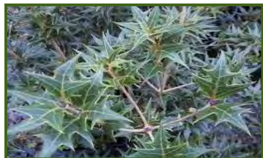
Osmanthus heterophyllus 'Sasaba'

There are many colorful selections that grow well in central North Carolina and provide great screening in suburban settings growing to 8-12' tall and wide. The variety 'Kembu' boasts vivid white and green foliage with a fine texture. 'Purpureus' is named for the dark purple flush of new growth. 'Sasaba' is a vigorous dissected leaf form