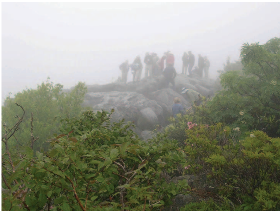
Fog in the Canaan Valley bog

On Friday morning I got up early and we were off to Dolly Sods Wilderness area. You don't just happen to drive into this area. It takes an effort and about an hour's driving time from the lodge. The weather was coolish and the visibility was limited - we could only see the end of the bus! The fog did lift and we got to see many wonderful plants. I saw Cornus canadensis in the wild for the first time. Other old friends were: an old Cypripedium acaule , Rhododendron prinophyllum (=rosea), and Kalmia latifolia . A high-