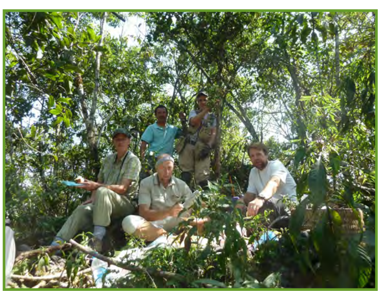
Lunch at base of Xanthocyparis vietnamensis.

On October 10<sup>th</sup>, we were in search of yet another rare confer, Amentotaxus hatuyenensis . We took an early morning hike from Ban Quan to an area where Ozzie and Scott had collected in 2010. We started hiking a 3,300' up a hot, dry, steep karst trail. At 4,700' at the top of a small mountain we found several specimens at the top of the ridge. We also found Viburnum sambucinum , Hedychium and we collected Magnolia insignis at the entrance to the dirt road at the village of Yan Ming.