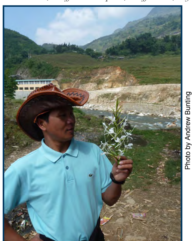
Uoc with alpinia

panax, Sarcococca coriacea and several rhododendrons.