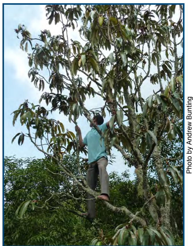
Uoc collecting Magnolia foveolata

On the morning of the 6<sup>th</sup> we began a trek that took us up a steep razorback ridge with sheer drops on either side. Shortly after the trek began it began raining. Around 11am we reached the pass of the Five Finger Mountain range at 8,220'. On the other side we traversed very deep terrain bush whacking through bamboo. Around 2pm in the pouring rain we