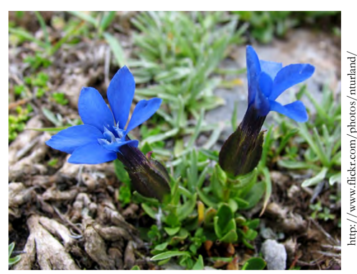
Gentiana verna subsp. balcanica

patterns by the action of freezing and thawing. The vegetation is mainly grasses, with abundant Lotus alpinus in places and a few plants of the brilliant blue Gentiana verna subsp. balcanica . The final approach to the summits of Olympus involves climbing vertical cliffs or steep gullies. The easiest route requires no climbing equipment, but you need a head for heights. It is a broad gully with 6-inch-wide rock-ledge steps