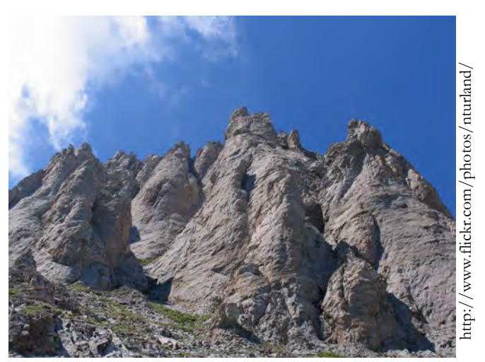
Mt. Olympus, Greece

near the Aegean coast of northern Greece. Olympus, the mythical home of the gods, is the highest mountain in