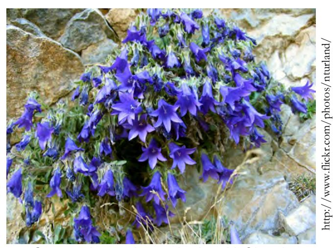
Campanula oreadum endemic to Mt Olympia

Above the forest zone rocky gullies shelter drifts of yellow Doronicum columnae and purple Geranium macrorrhizum , the latter with its characteristically musky-scented leaves. Here you might be lucky and find the odd plant of Aquilegia ottonis subsp. amaliae . On rocky slopes the endemic, silver-leaved Potentilla deorum is frequent, while on rock faces the endemic Campanula oreadum forms conspicuous blue patches. On the Plateau of the Muses, the ground is subject to solifluction, the sorting of stones and soil particles into stripes and polygonal