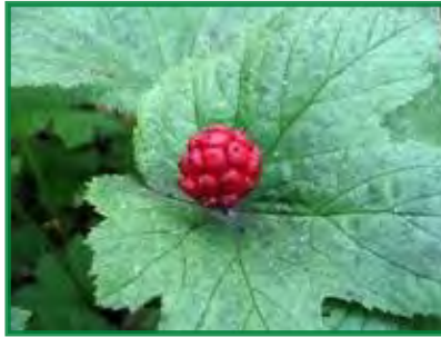
Hydrastis canadensis fruit

Bloom: White, in spring, followed by a single cluster of red berries in summer.