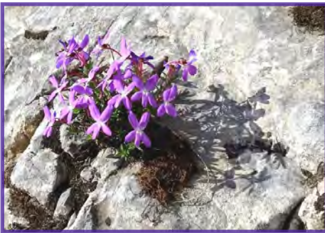
Viola delphinantha on Mt. Olimbos

So another quarter century elapses, and after an enchanting day visiting the botanic garden in Reykjavik, Iceland (Icelandic airlines encourages layovers), five days in Copenhagen studying in the Herbarium and their remarkable botanic garden, a few days getting our bearings in Istanbul, and preparing for our first destination a few hours southwards, across the Bosphorus in Asia, we begin our journey with a quick ascent on the Teleferik onto the slopes Ulu Dag above Bursa: for what we saw and what happened next, you'll have to come to my talk in a few weeks time! ✨