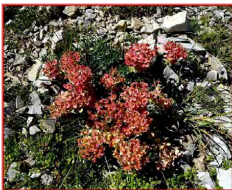
Euphorbia cf. anacampsera -Mt. Tynof