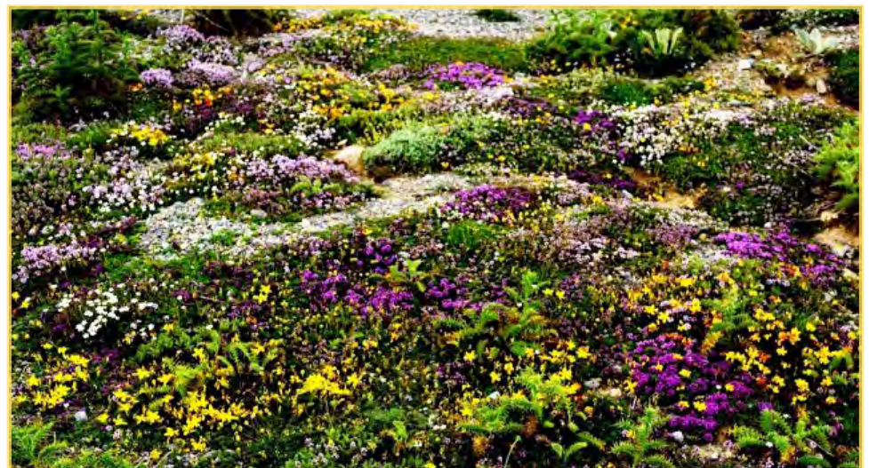
Alpine steppes on Kaz Dag