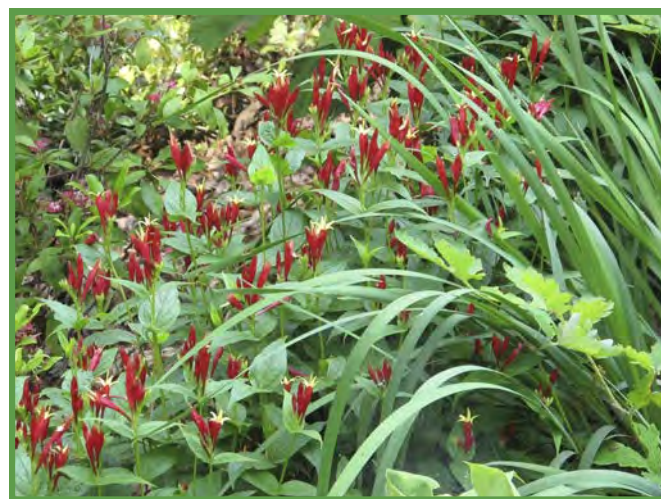
Spigelia marilandica (Indian pink)