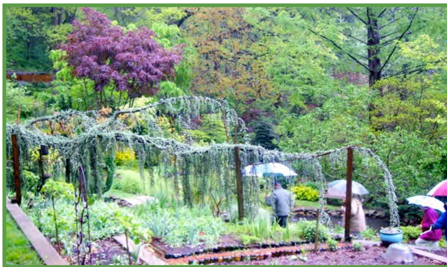
Weeping Blue Atlas Cedar