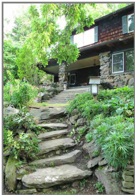
Entrance to the House