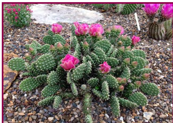
Opuntia x 'Red Gem'