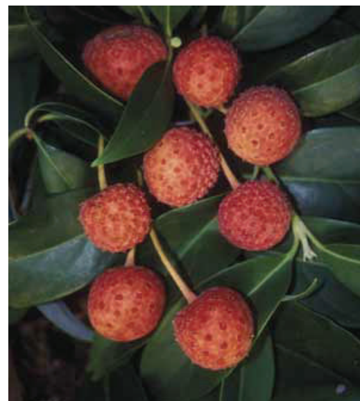
Cornus angustata ‘Empress of China’ fruit

Bring plants (free) to swap with fellow chapter members — no plant sale or auction at this event