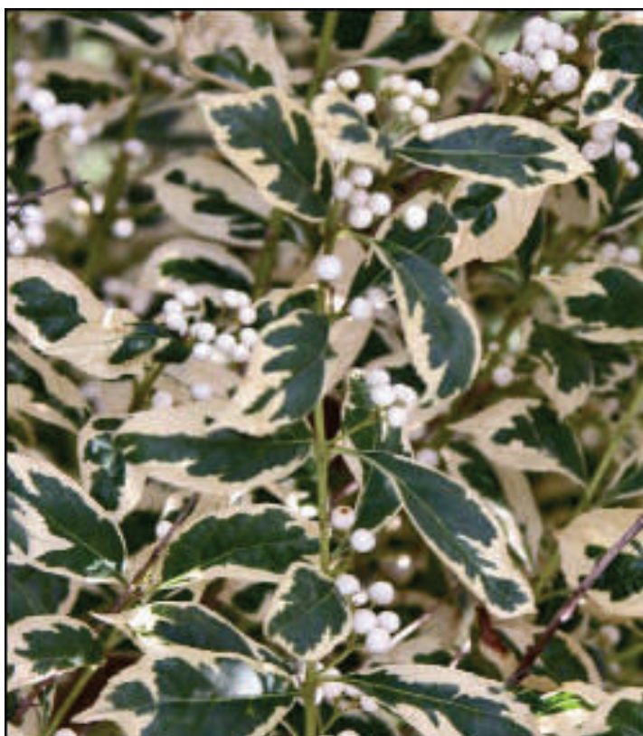
Callicarpa dichotoma 'Duet'