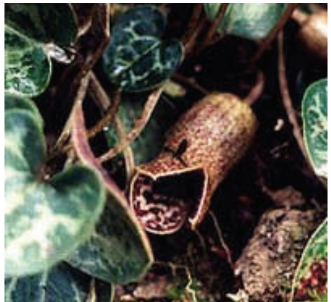
Asarum shuttleworthii var. harperi 'Callaway'

The Asian asarum however are perhaps the most desirable plants for collectors. However many of them are borderline hardy in our area and are rather expensive to purchase. I grew A. kumageanum a zone 7 plant from Japan for many years but lost it one winter. It was perhaps one of the most attractive asarum I have grow. A. splendens also very nice from China now widely