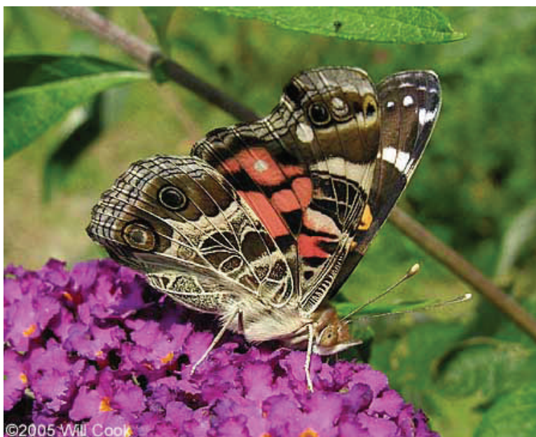
Vanessa virginiensis “American Lady”

In addition to meeting our basic needs, please think about butterflies as you maintain your garden. I’m sure you are very sensitive about these types of issues already, but it’s very important for you to minimize use of pesticides or practices that might harm butterflies or caterpillars. Consider physical or biological controls for undesirable insects. If you must use a natural or synthetic insecticide, read the label carefully.