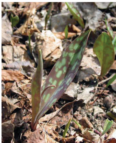
Erythronium americanum foliage

more common. S. amplexifolius is more robust and is restricted to moister sites close to streams or along seeps. No eastern woodland would be complete without the presence of at least one species of Trillium . Fortunately, two are quite at home